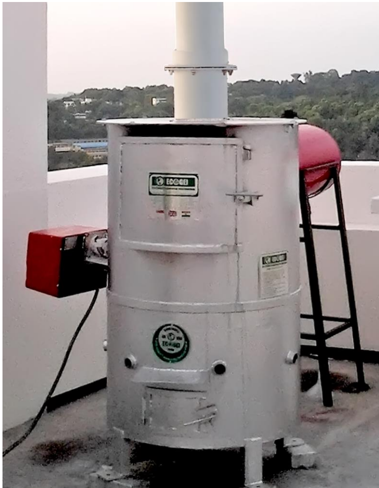
20Kg INCINERATOR WITH DIESEL SUPPORT