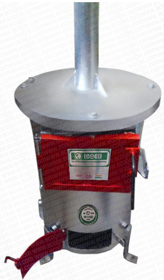
DOMESTIC INCINERATOR-SMALL HOME INCINERATOR