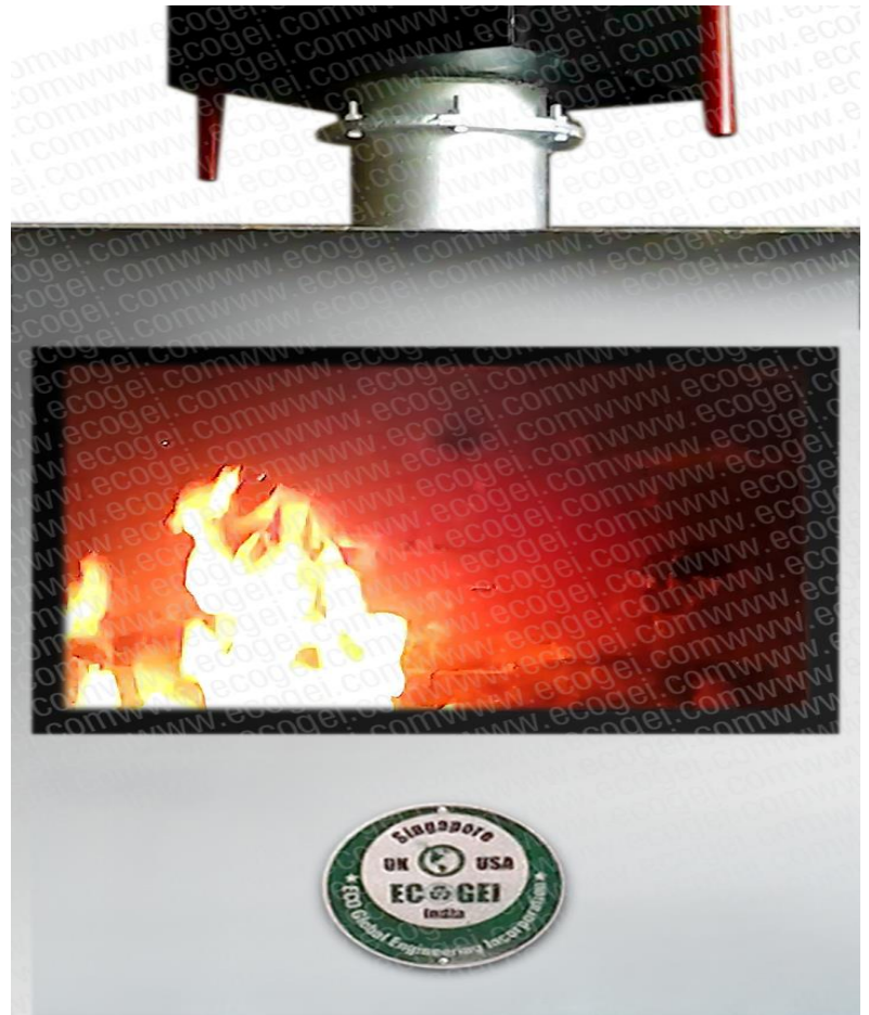
HEAVY DUTY INCINERATOR-2