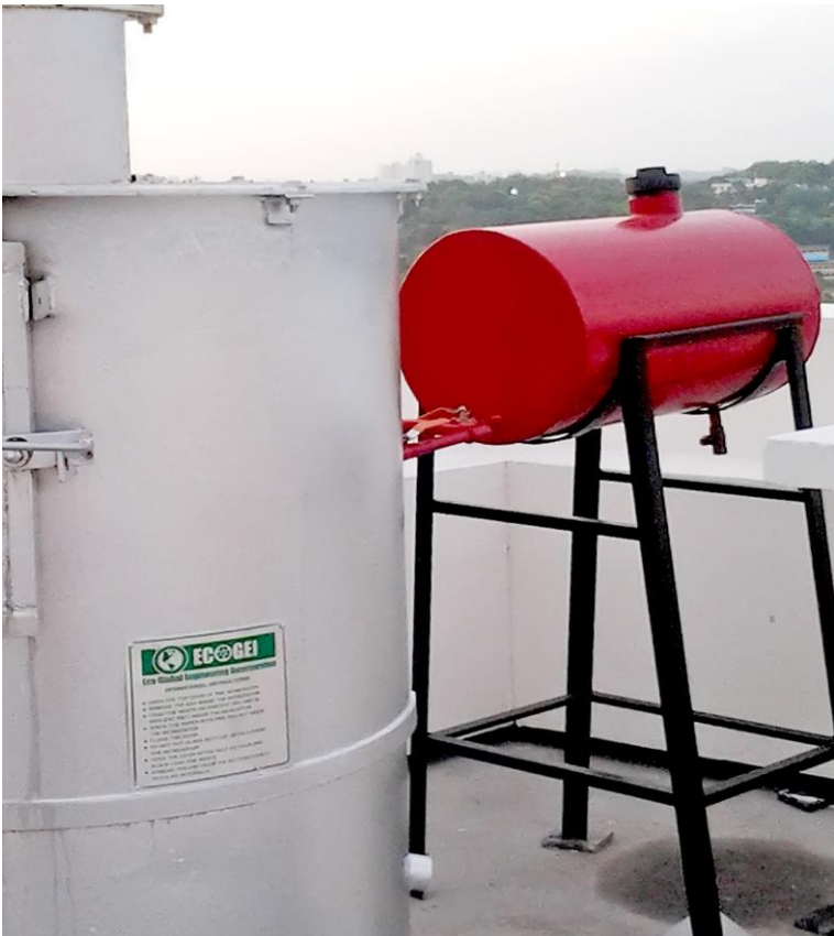
40Kg INCINERATOR WITH DIESEL SUPPORT