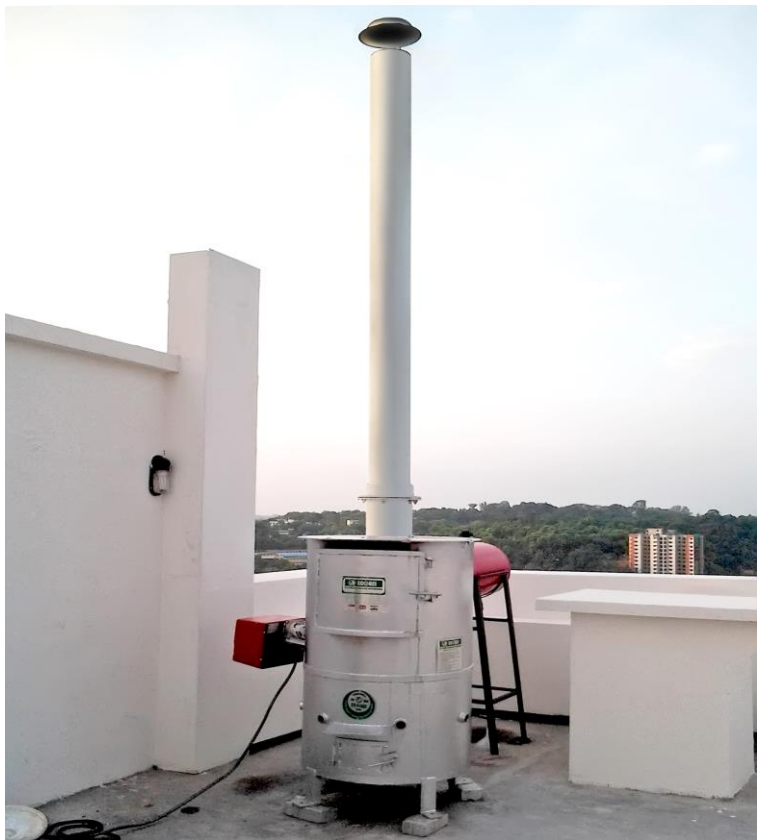
30Kg INCINERATOR WITH DIESEL SUPPORT