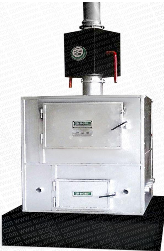
HEAVY DUTY INCINERATOR-1