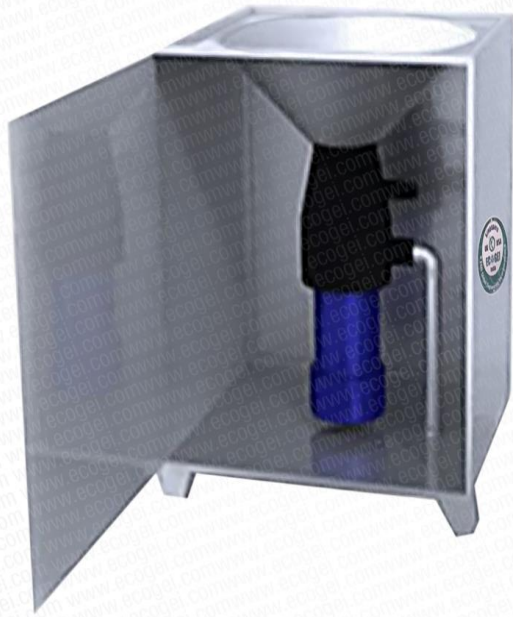
CRUSHER-FOOD WASTE DISPOSER